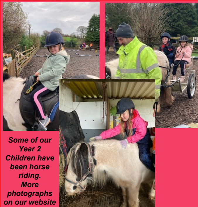
Some of our Year 2 Children have been horse riding. More photographs on our website

character or wear your Pyjamas and bring your favourite book